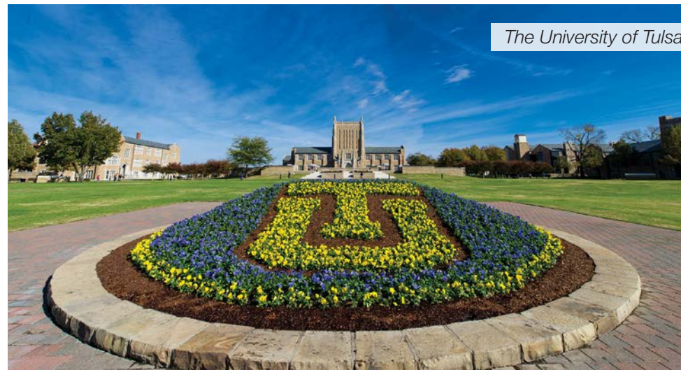
The University of Tulsa